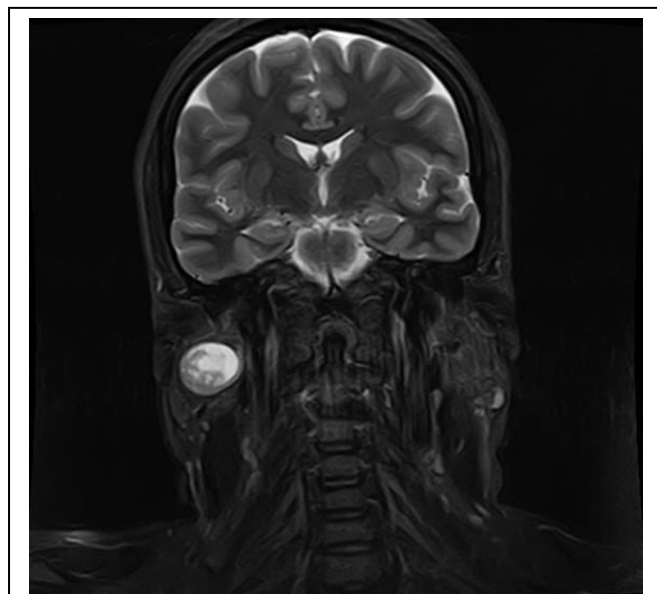
Figure 2: A well-defined predominantly cystic lesion. The solid components demonstrate contrast enhancement.

An initial USS of the salivary glands demonstrated a hypoechoic, 25mm, lobulated, thick-walled cyst, deeply embedded in the posterior part of the right parotid gland, lying posterior to the mandible (Figure 1). For further characterisation, MRI was performed during which period the pain had significantly worsened. This showed a well-defined predominantly cystic lesion measuring 22mm x 22mm x 17mm with low intensity T1 and high intensity T2 signals along the superficial and deep lobes of the right parotid, centering the retromandibular region. The solid components demonstrated contrast enhancement (Figure 2). A few normal-appearing intra-parotid lymph nodes were noted with no enlarged or suspicious neck nodes. The conclusion was made of a benign or low-grade predominantly cystic tumour extending in to the deep lobe, most likely representing a Warthin's tumour. The patient subsequently underwent FNAC as she was pregnant and not willing to undergo surgery. Moreover, given the possibility of a low-grade possible malignancy which would have changed the management approach, invasive testing was required. The FNAC showed a benign lesion with cohesive sheets of oncocytic type cells and scattered lymphocytes in keeping with a Warthin's tumour. As the patient was pregnant, further intervention was postponed. Repeat MRI findings 16 months later were consistent with the previous scan however demonstrated an increase in size to 30 x 22 x 21mm.