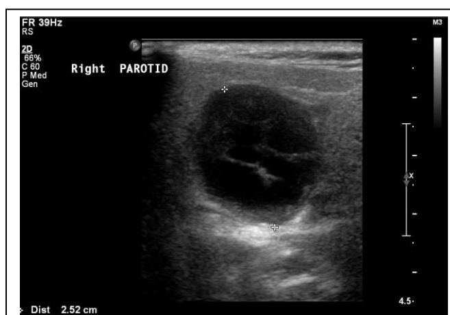
Figure 1: A markedly hypoechoic, well-circumscribed mass in the right parotid gland with no demonstrable internal vascularity representing a cyst with inspissated contents or a mixed solid and cystic lesion.

A 39 year old pregnant Pakistani female presented with a 5 year history of a painful enlarging right parotid mass. The patient denied any history of facial weakness or constitutional symptoms. She had an unremarkable past medical and family history and was not on any medications. On clinical examination, there was a tender, soft, mobile lump measuring approximately 20mm x 20mm. There were no signs of infection or associated lymphadenopathy and no evidence of facial nerve involvement. Laboratory tests including white cell count, C-reactive protein, viral serology and erythrocyte sedimentation rate were all within normal limits.