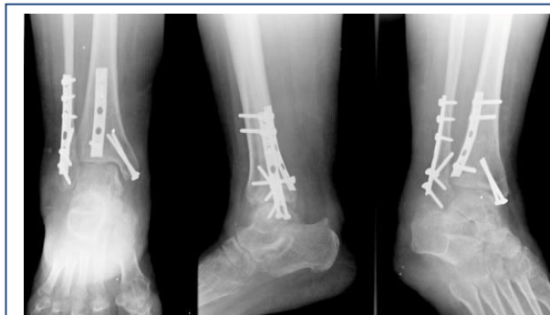
Figure 8: Follow-up X-rays.

Post-operative x-rays were performed after the patient has recovered from anesthesia (Figure 7).