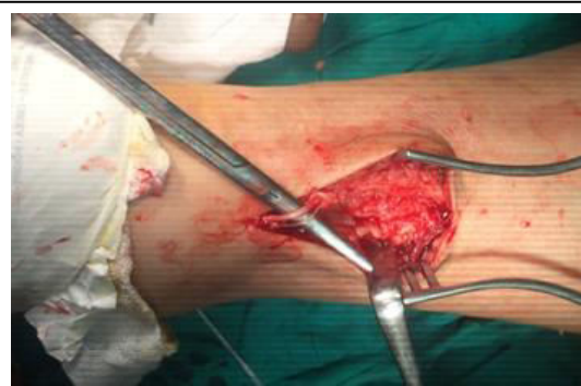
Figure 4: Holding the reduction using pointed reduction clamp.