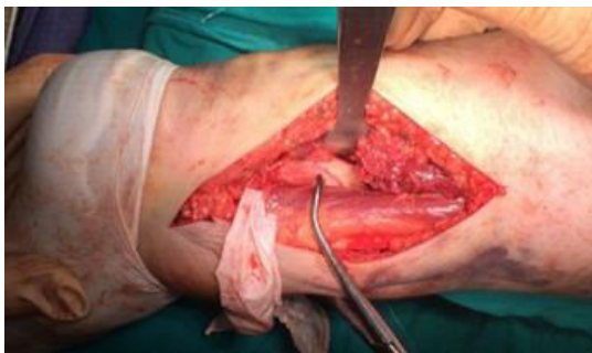
Figure 3: The sural nerve and the small saphenous vein.

Hallucis Longus (FHL) medially -supplied by the tibial nerve-, FHL was recognizable by moving the great toe and also by being fleshy till the distal part of tibia.