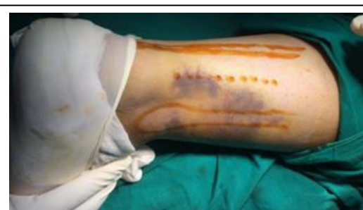
Figure 2: Landmarks (midway between lateral malleolus and Achilles tendon).

However, the sural nerve was not always encountered, as it usually runs just behind the lateral malleolus, well anterior to the incision [9]. Exposure of the posterior aspect of the tibia was done through an interval between the peronei laterally - supplied by the superficial peroneal nerve- and the Flexor