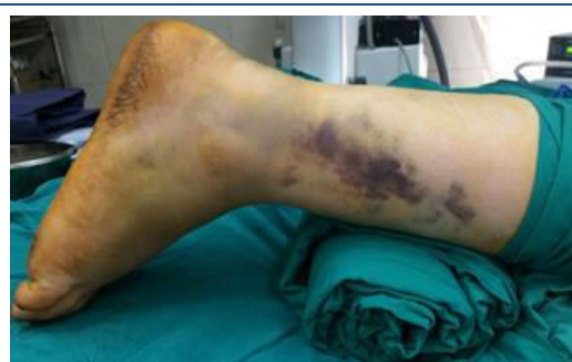
Figure 1: position of the patient.

-Position: using a radiolucent table, while supine, the limb was exsanguinated by elevation for three to five minutes, and then a tourniquet was applied around the thigh. The position was then changed into prone position with the knee flexed around 20° (Figure 1), the ankle was placed over a small bump to allow the foot to be hanging free over the bump, so that gravity aids reduction of any displaced posterior fragment rather than being an opposing force as when in supine position. Skin incision was made midway between the posterior aspect of the lateral malleolus and the lateral border of Achilles tendon (Figure 2), extending from the tip of the lateral malleolus as far proximally as required. The sural nerve and the small saphenous vein were pursued under the superficial fascial layer and included in the lateral flap (Figure 3).