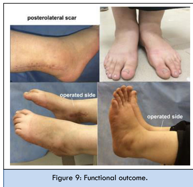
Figure 9: Functional outcome.

then the cast was removed and full weight bearing was initiated.