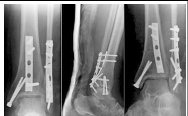
Figure 7: post-operative X-rays