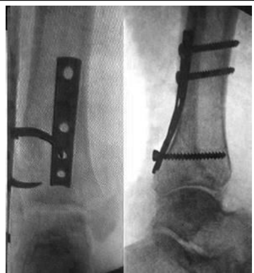
Figure 6: Checking plate position using image intensification.

fragments and debris between fragments were removed; proximal displacement of the posterior malleolus was reduced by axial and anterior traction on the foot. The fracture was reduced anatomically under direct vision, using the edges and the apex of the fracture line as a guide, The fragment was fixed by placing a posterior antiglide plate (one-third tubular plate) with under contouring to provide a satisfactory buttress effect, the nearest screw to the fracture proximally was the first to be placed, screws were also placed in the fragment through the plate if the fragment was of sufficient size (Figure 5), internal rotation of the foot around 15 degrees during placement of the screws helped to achieve more accurate trajectory .The plate position, screws and accuracy of the reduction were checked using image intensification (Figure 6).